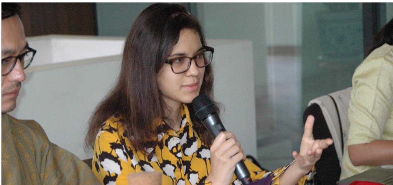
A youth shares her views

In addition to possessing a discerning mind and a strong value system, there are other factors that invariably play a significant role in how resilient a person is.