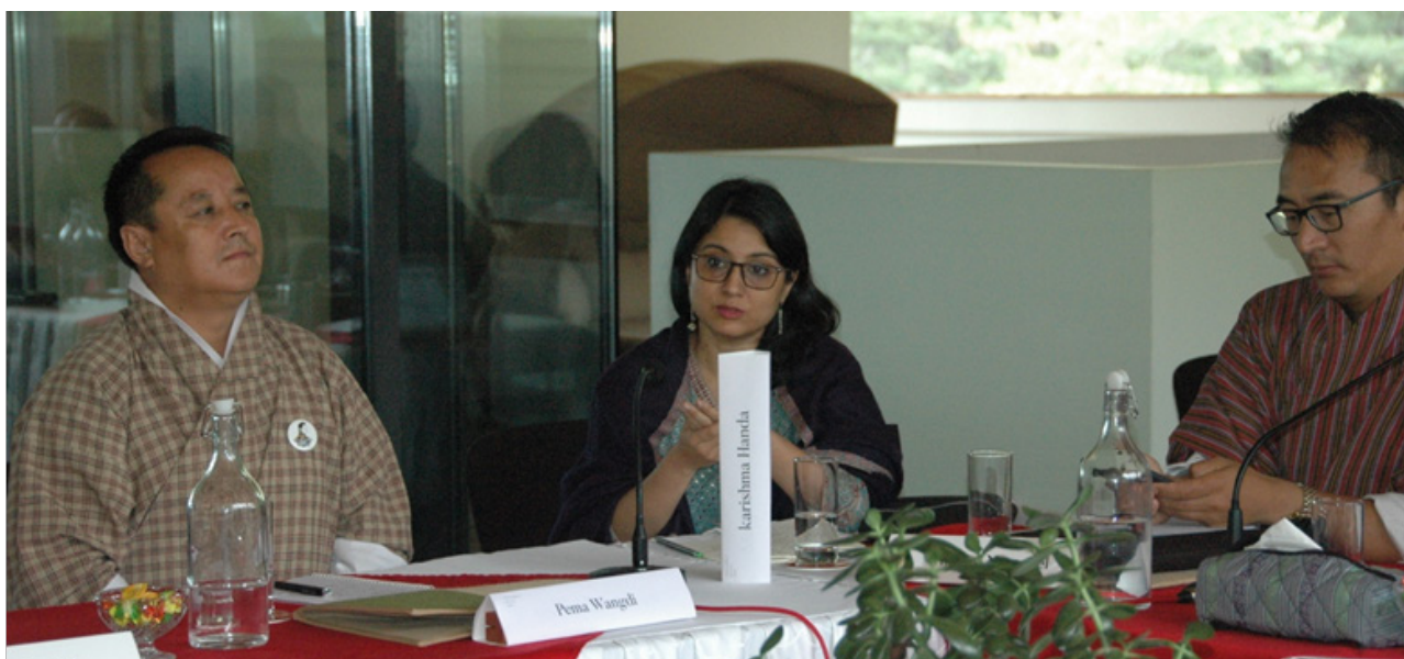
Panelists share what the curriculum on resilience should entail

of current machines and technologies to further human capabilities and push the boundaries of our intelligence and existence.