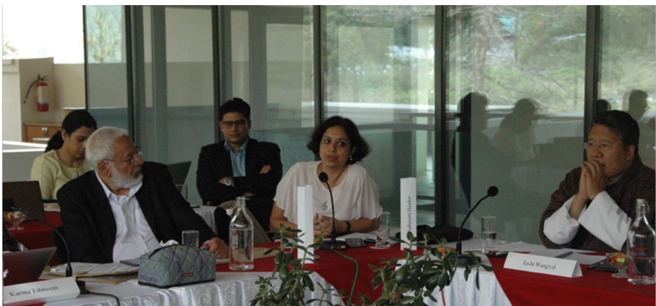
The impact of technology is deliberated upon

There is another facet of technology that people are quite wary of – the concept of Artificial Intelligence. The fear is that while technology makes our lives much easier and does our work for us in a more efficient way, it also leaves us less involved and less engaged, thereby dumbing us down mentally and in other facets. However, we need to acknowledge that this scenario also presents tremendous opportunities and potential. With the machines and technologies taking over mundane and repetitive tasks, people can shift their focus on augmenting human intelligence. We can focus on important concepts such as learning how to learn, cultivating creativity, and inculcating resilience. The concept of Augmented Intelligence is different from Artificial Intelligence because it consciously and purposefully makes use