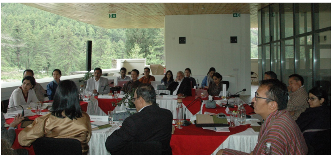
Panel discussion in session

The panelists noted that resilience is a well-researched topic and there is a lot of literature on it. Based on the existing resources, it was concluded that resilience can indeed be inculcated and developed as opposed to a fixed biological trait in humans that cannot be