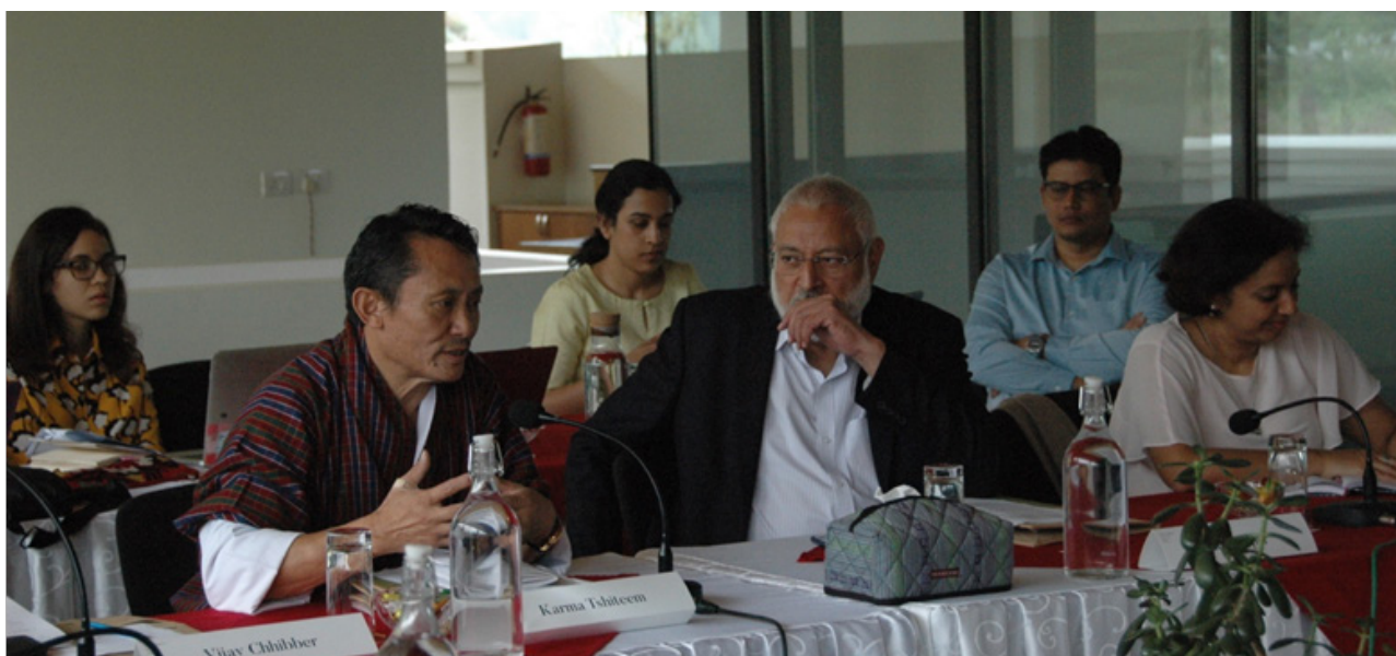
The chairperson talks about the importance of mindset and outlook

therefore resilient. From a Buddhist perspective, resilience is viewed as more of a characteristic of an 'immovable object', tough and unaffected in challenging situations. On the other hand, Western, primarily capitalist, idea of resilience would be that of an 'unstoppable force', robust and overcoming all obstacles on its way. It was decided that a truly resilient person would embody both, oscillating between the two skillfully based on the situation.