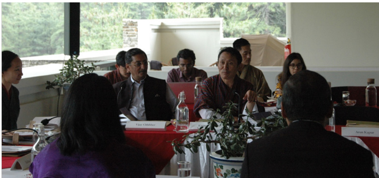
The dichotomy of Eastern and Western perspectives is discussed

changed. The resources cited included the ABCDE (Acceptance, Belief, Commitment, Discovery, Evaluation) strategy, concepts of Tragic Optimism and Positive Psychology, and various lesson plans used for inculcating resilience. Popular literature included Grit: The Power of Passion and Perseverance by Angela Duckworth and Drive: The Surprising Truth About What Motivates Us by Daniel H. Pink. The first book makes a point that perseverance and determination are key to overcoming challenges, while the second one discusses how autonomy, self-mastery and purpose are key sources of intrinsic motivation that is necessary to thrive. Other concepts discussed were the Philosophy of Stoicism, Self-Determination Theory and Emotional Intelligence.