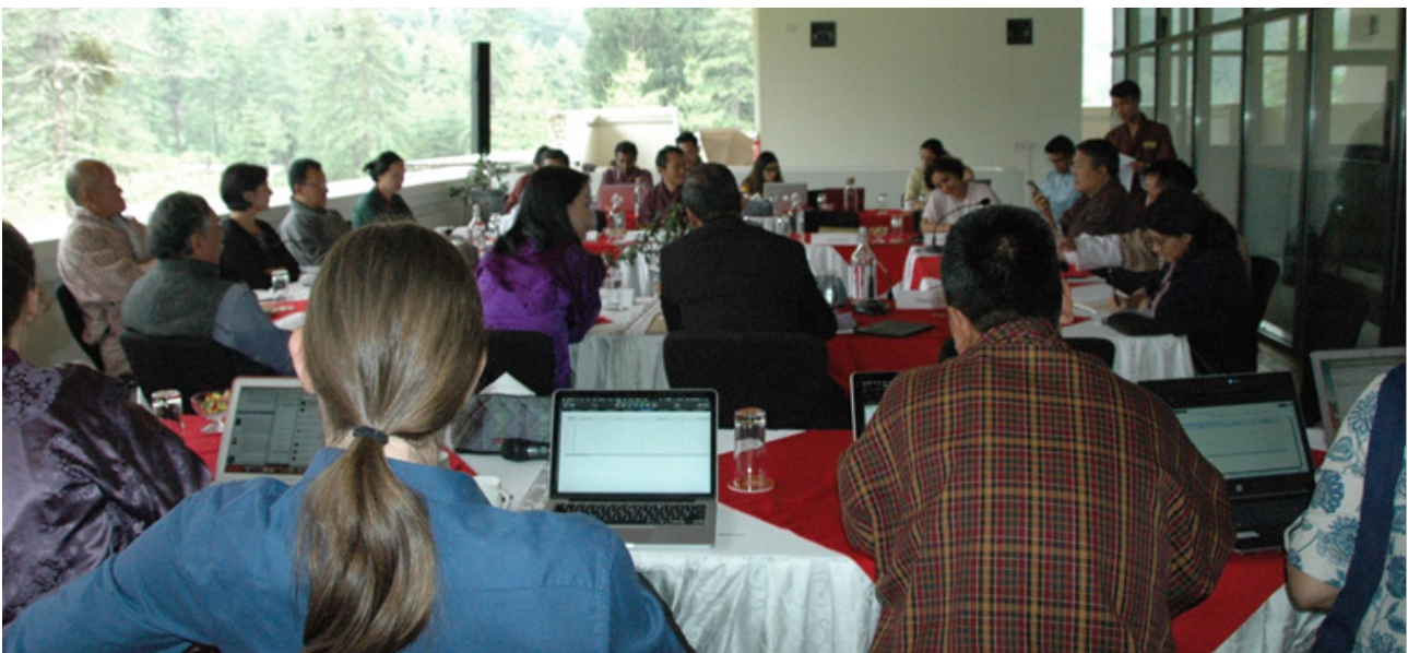
The second day of discussions in progress

The influence of the environment on a person's level of resilience points to the understanding that resilience is a cultural formation. One's environment and context matter. Cultural variance is evident in inculcating and even defining resilience. For example, the problem of over-medication in the West versus the stigma that exists in discussing mental health in many Asian societies provide the varying context to understanding how resilience manifests itself today. In the West, it is considered resilient if you are able to accept your weaknesses and actively seek help. Conversely, in the East, resilience is equated more with the ability to toughen up and deal with your issues on your own. That is why it is important to discuss the notion of resilience in the context and time that one finds herself in.