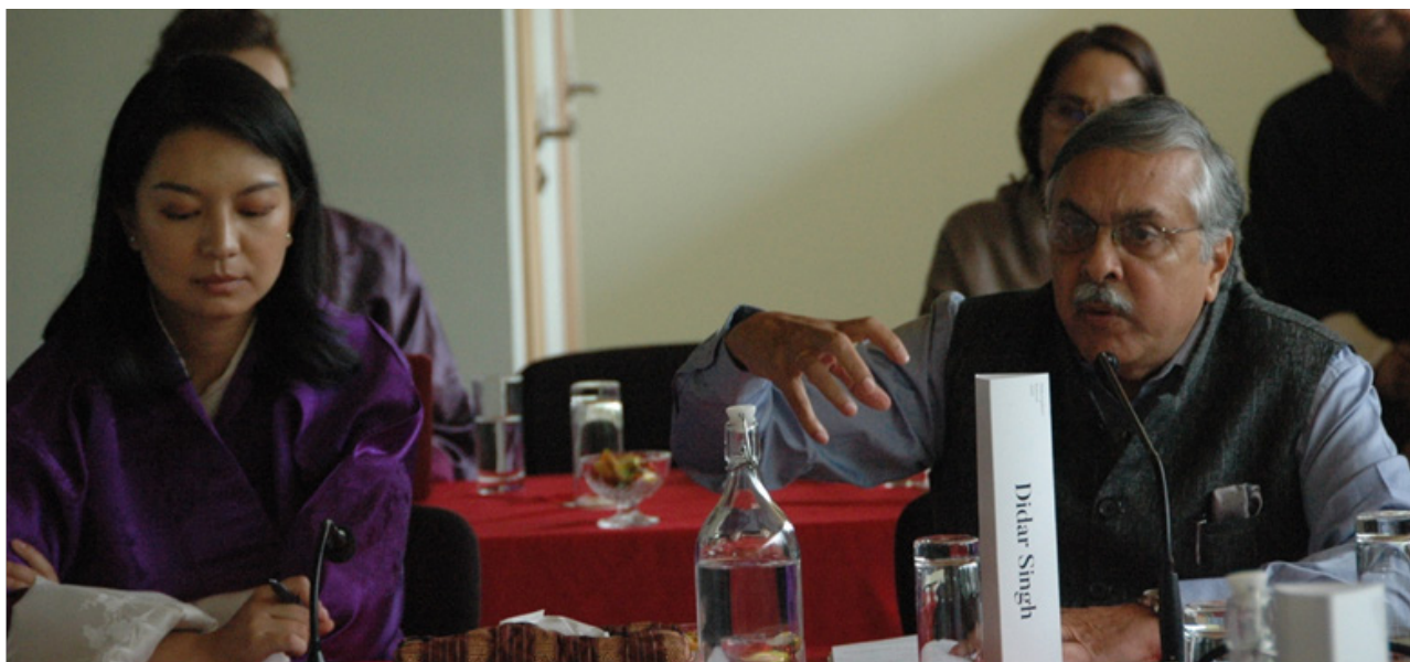
The significance of role of parents, teachers and society is discussed