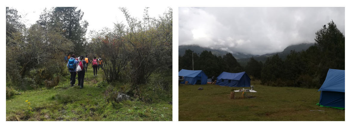
(pictures (left to right) on the way to Gogona campsite; campsite 2 at Gogona)

Early next morning, we saw the serene beauty of the surrounding nature around us. We went to Gangtey Tshechu, and the bus dropped us at a point where we had to walk to our second campsite at Gogona. The walk was most engaging and fun. We sang songs along the path and played games too. We reached the campsite and this was also a beautiful and isolated area. We had an interesting session with the two facilitators from India that provoked many questions in all our heads.