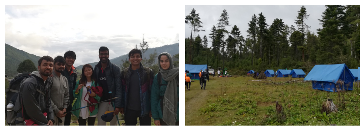
(pitcures (left to right)- on the way to Khotokha; campsite 3 at Khotokh)

The following day, we left our third campsite early in the morning as we had a long trek to Khotokha. On the way, we talked, san, treasuring every momoent that we had together. We reached the campsite at Khotokha. This was our last day of camping. That night we had a very interesting and insightful five question group discussion activity. We discussed ways in which India and Bhutan could strengthen their relationship via trade, the job market. We also spoke about issues that the countries faced and how they could be solved. We came up with possible solutions and it was a healthy exchange of opinions. Since it was our last night camping we danced around the fire to Bhutnaese folk songs and some Indian songs too.